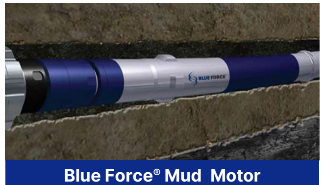
Blue Force® Mud Motor